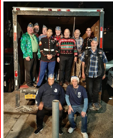
Kings County Sons of the American Legion members gathered at the Michael A Rawley, Jr. Post 1636 in Brooklyn for the annual Toys For Tots party on December 9th.